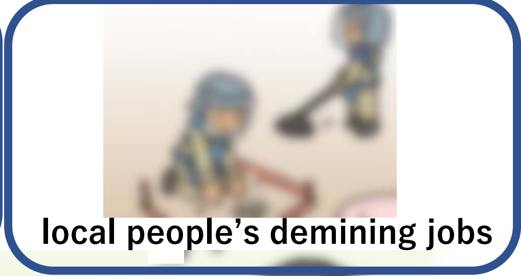
local people's demining jobs